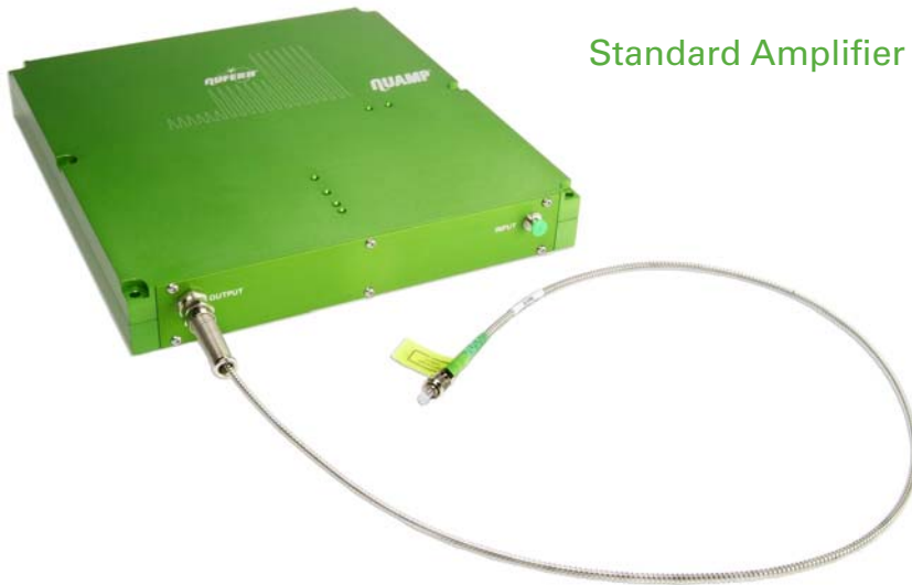
Standard Amplifier Package